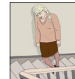
Feeling weak and tired