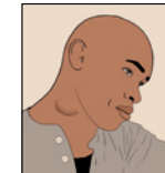
Swelling on the neck, under the arms, or in the groin

These are also common signs of some other diseases. So, to be sure that it is TB, you have to take different tests. A person with TB often do not have all of these symptoms. Some people only have mild symptoms.