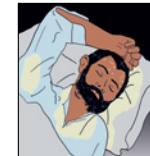
Sweating at night