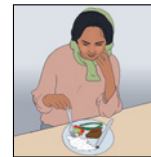
Loss of appetite

Other common signs of TB – both lung TB and TB in other parts of the body – are: